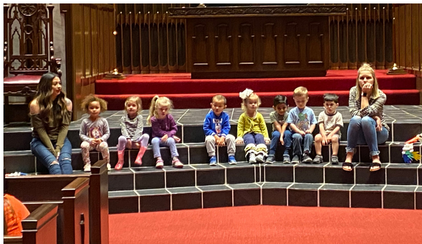
The 2-year-old class is ready to show off the “hearts and hands” they have made to illustrate this month’s Bible verse, “Serve one another in love” (Galatians 5:13).