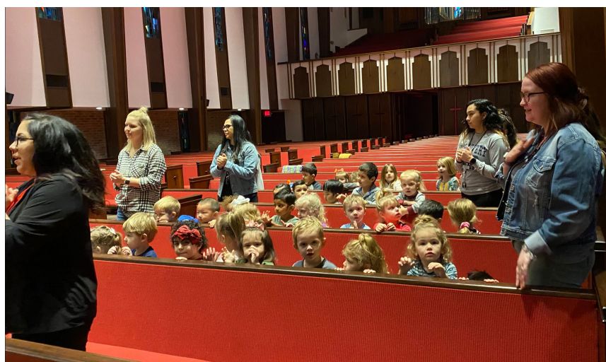
The whole “student body” gathers to sing and pray and have a good time during Children’s Chapel.