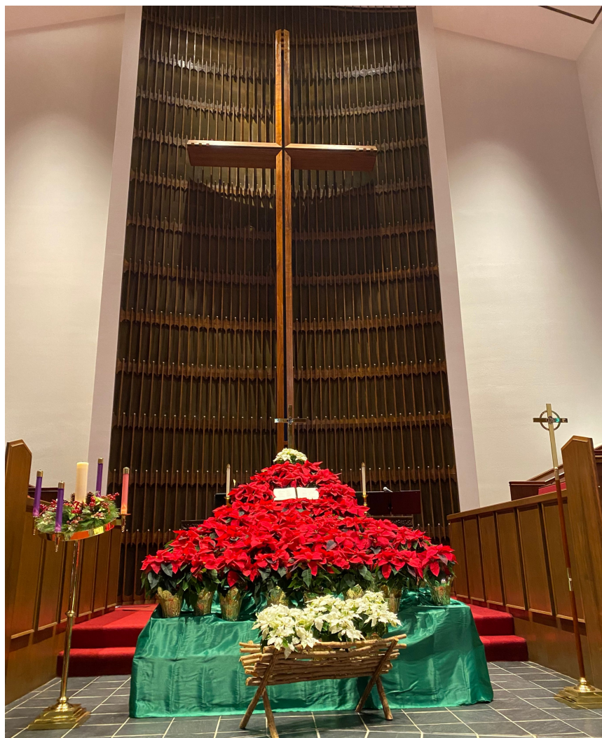
Our beautiful Poinsettia Christmas Tree