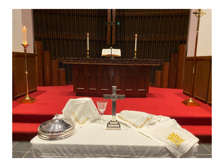
WORSHIP SERVICE ON SUNDAY, DECEMBER 6, 2020

Our Scripture readings for next Sunday, December 6, 2020, the Second Sunday of Advent are: Isaiah 40:1-11; and Mark 1:1-8. The sermon title is "The Beginning of the Gospel," and the Bulletin is available here: <a href="https://fpcofvictoria.org/wp-content/uploads/2020/12/2020-12-6-Bulletin-PDF-1.pdf">https://fpcofvictoria.org/wp-content/uploads/2020/12/2020-12-6-Bulletin-PDF-1.pdf</a>