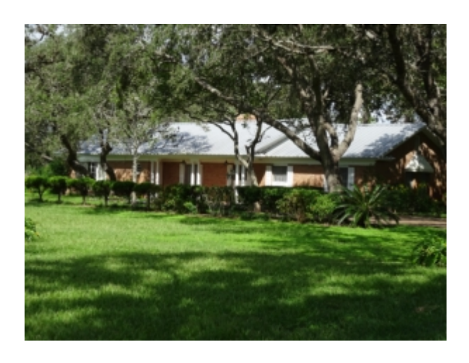
AN INVITATION FROM THE MISSION AND OUTREACH COMMITTEE

We look forward to this being a beautiful and worshipful Advent Season at First Presbyterian Church of Victoria, Texas.