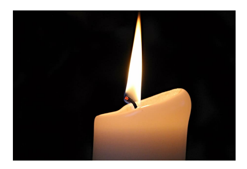
CARES AND CONCERNS

For more information, look for the "Christmas Poinsettias" leaflet which will be inserted in our worship service bulletins during the coming Sundays, or click here to be able to read and, if you wish, print the form: <a href="https://fpcofvictoria.org/wp-content/uploads/2020/12/Poinsetta-Order-Form-2020-PDF-1.pdf">https://fpcofvictoria.org/wp-content/uploads/2020/12/Poinsetta-Order-Form-2020-PDF-1.pdf</a>.