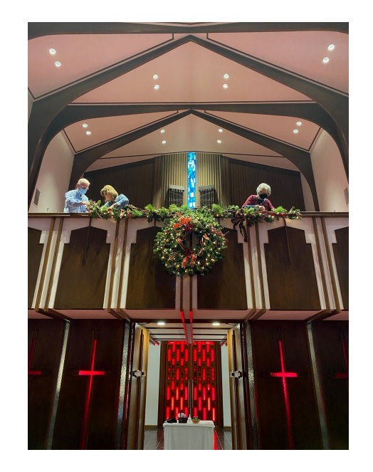
WORSHIP SERVICE ON SUNDAY, DECEMBER 13, 2020

Our Scripture readings for next Sunday, December 13, 2020, the Third Sunday of Advent, are: Isaiah 61:1-4, 8-11; and John 1:6-8, 19-28. The sermon title is "John the First Witness," and the Bulletin is available here: <a href="https://fpcofvictoria.org/wp-content/uploads/2020/12/2020-12-13-Bulletin-PDF-2.pdf">https://fpcofvictoria.org/wp-content/uploads/2020/12/2020-12-13-Bulletin-PDF-2.pdf</a>.